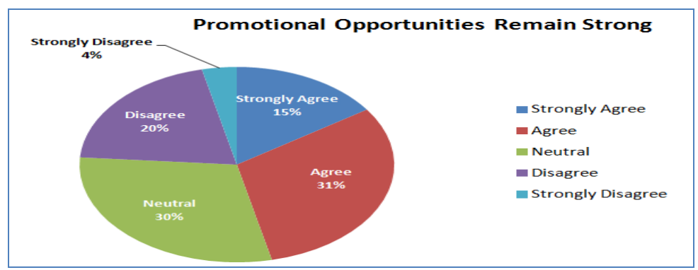
Figure 2 - Primary Research Results: Promotional Opportunities for employees