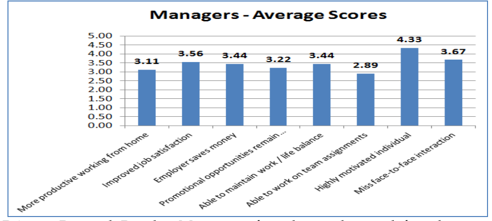
Figure 3 - Primary Research Results: Managers of employees that work from home