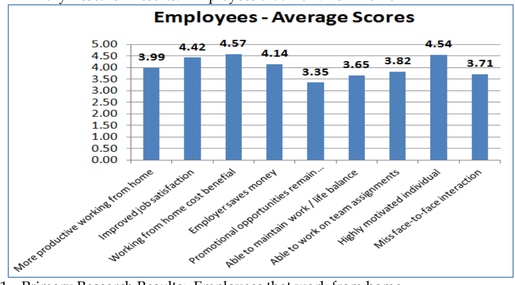
Figure 1 - Primary Research Results: Employees that work from home